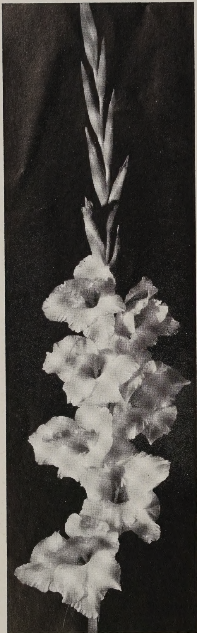
LAVENDER AND GOLD

CORONA (Palmer) (Midseason) One of the season's most captivating flowers was tall, distinctive Corona. It comes well-named since a corona of light rose pink encircles a creamy throat. Believe it to be one of Palmer's best. Opens 6-8 large, wide-open blooms on a lengthy straight spike. A cluster of large fat bulblets come well attached to each bulb as one lifts them out of the ground. (L. 2-.30; 10; 10-$1.20) (M. 2-.20; 10-.80) (S. 4-.25; 10-.50) Bbts. .20 pkg.